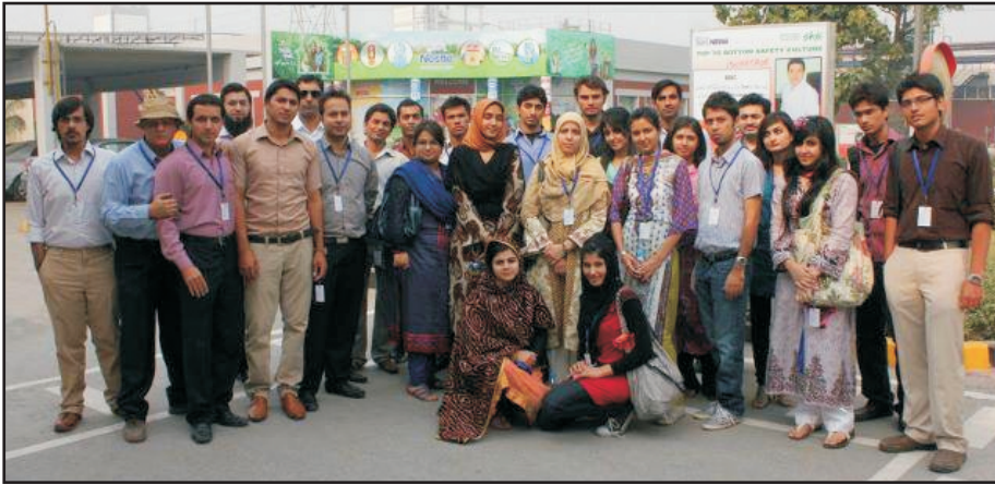
Students of FAST Business Club pose after trip to Nestle factory

Best Practices- FAST Business Club at FAST School of Business, Lahore Campus organized an industrial trip to Nestle's Sheikhpura factory on November 2, 2011. Visiting manufacturing unit of one of the world's most renowned food brands proved to be a learning experience for the students. Students were able to