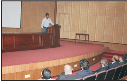
Guest speaker is delivering speech

FAST Business Club (FBC), Lahore Campus arranged an interactive guest speaker session in which senior executives of Metro Cash & Carry Asia were invited to speak on Supply Chain at Metro and opportunities for Pakistani professionals in supply chain as well as in Metro Group.