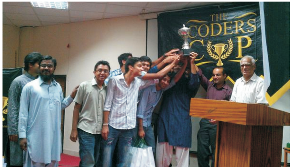
The winning team is showing trophy at Coders Cup 2011

The teams were assigned one of the six houses namely Gladiators, Perceptors, Legion, Invincibles, Skyfire and Magnus. In the grand finale, all the houses battled for the ultimate glory. In the end, Gladiators were crowned champions of The Coders Cup 2011.