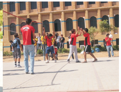
Students are participating in different games at Sportics: League of Glory 2011 held at FAST-NU Karachi Campus