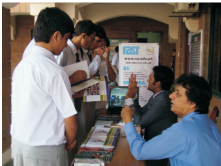
FAST-NU career desk guiding the student about career choices and FAST University