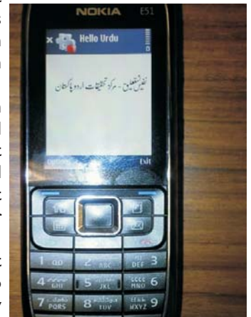
Image shows Nafees Nastalique Open Type Font rendered on Nokia E51.

This project aimed at investigating deployment of Pango on Adroid mobile platform by Google and developing training material to enable the same for other scripts.