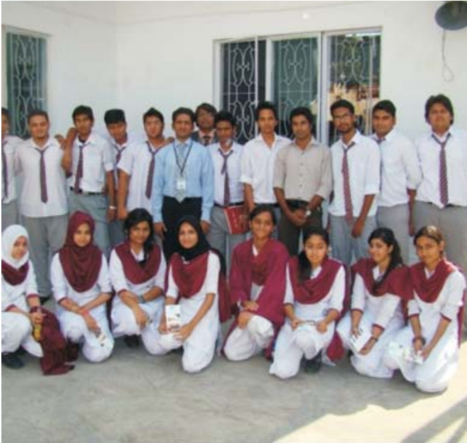
A-Level students of The City School in a group photo with FAST-NU team.

A team of the faculty, staff and alumni of the NU Karachi Campus visited The City School on November 3. They gave a presentation to A-Level students about facilities and quality of education at the FAST-NU.